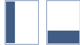
Third Vert/Horiz 85x375mm / 255mmx125mm